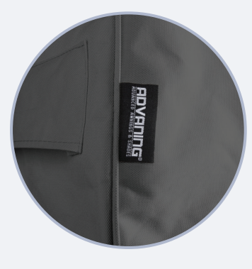
REINFORCED SEAMS FOR STRENGTH & DURABILITY