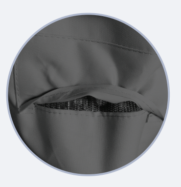
VENT FOR REDUCING CONDENSATION & WIND LOFTING