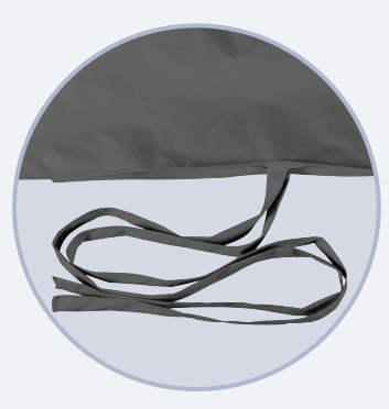
EXTRA-LONG STRAPS FOR ADJUSTABLE AND SECURE FIT