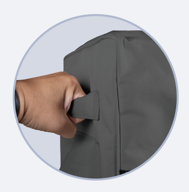
COMFORTABLE HANDLES FOR EASY FITTING & REMOVAL

*Complete reports are available upon request